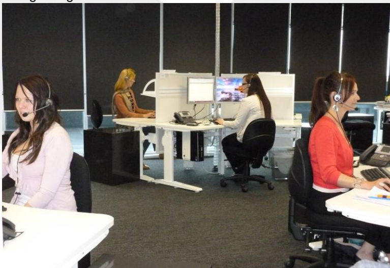
ITSA National Service Centre in Adelaide

The National Service Centre is now taking telephone enquiries on 1300 007 777 or 1300 00PPSR. The current opening hours are 8.30am to 5.00pm (Australian central time or Adelaide local time) Monday to Friday, excluding public holidays. These hours will be extended once the PPS Register goes live.